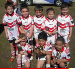
The Mighty U6 Whites.