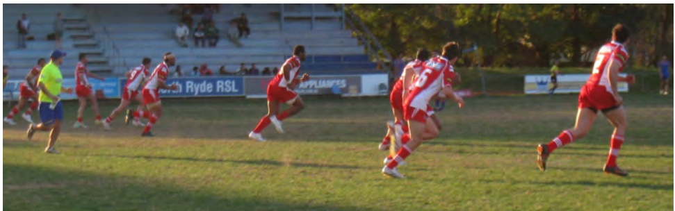
Burwood North Ryde United on the attack.